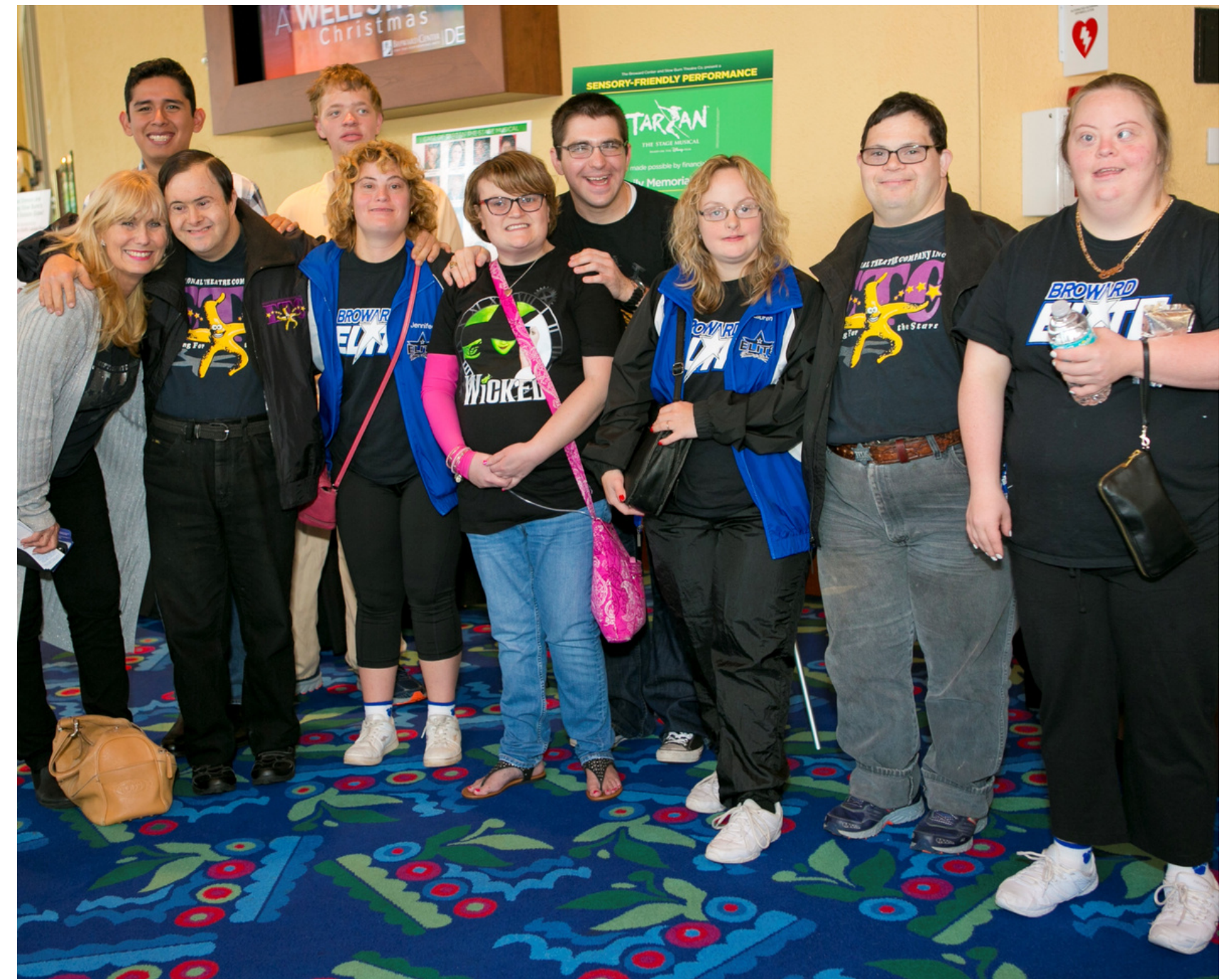
Stay with my group