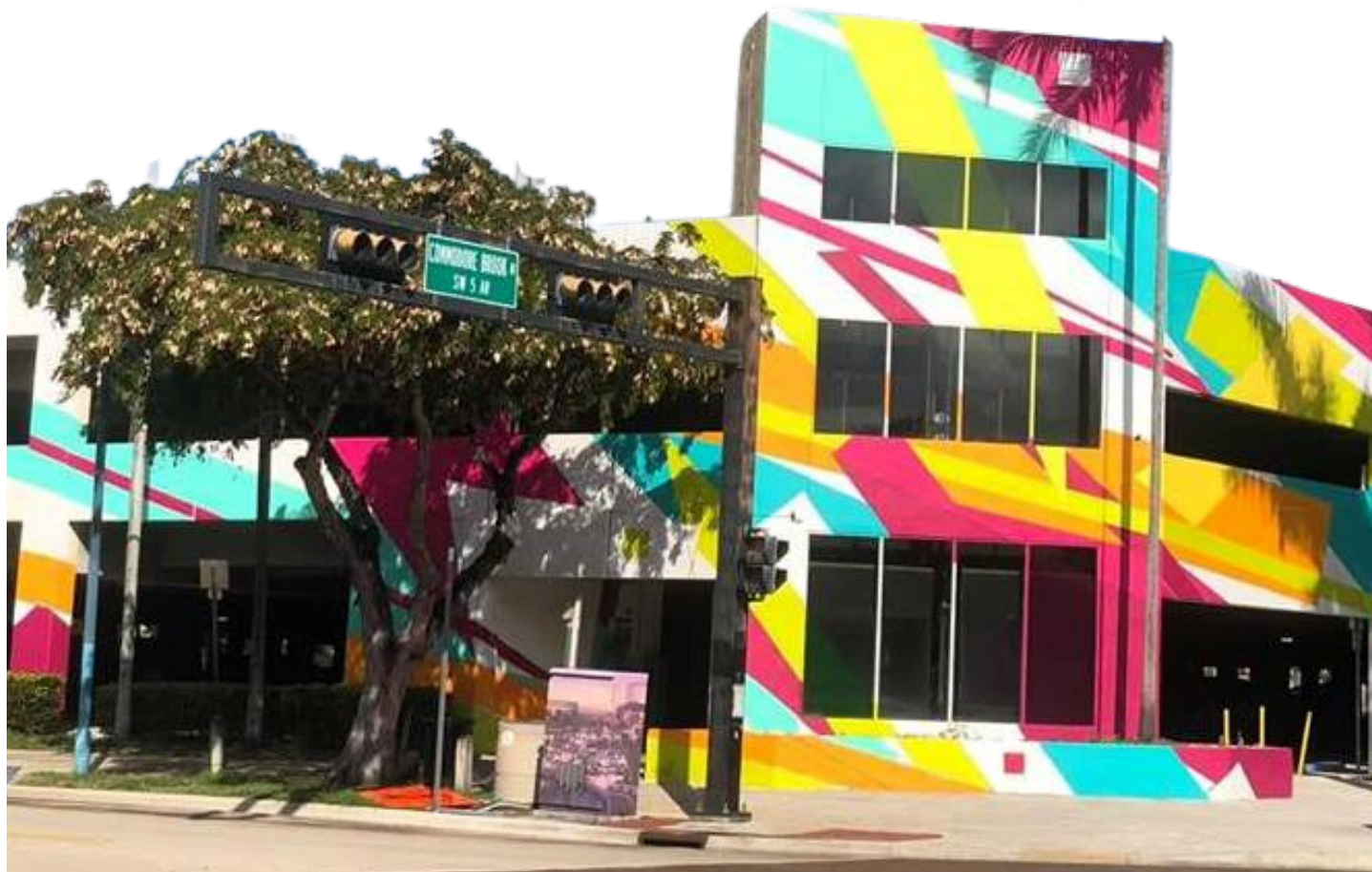
Across the street parking garage

When I get to the Broward Center, I will come from the parking garage across the street or I will be dropped off at the top of the hill at the Amaturro Theater.