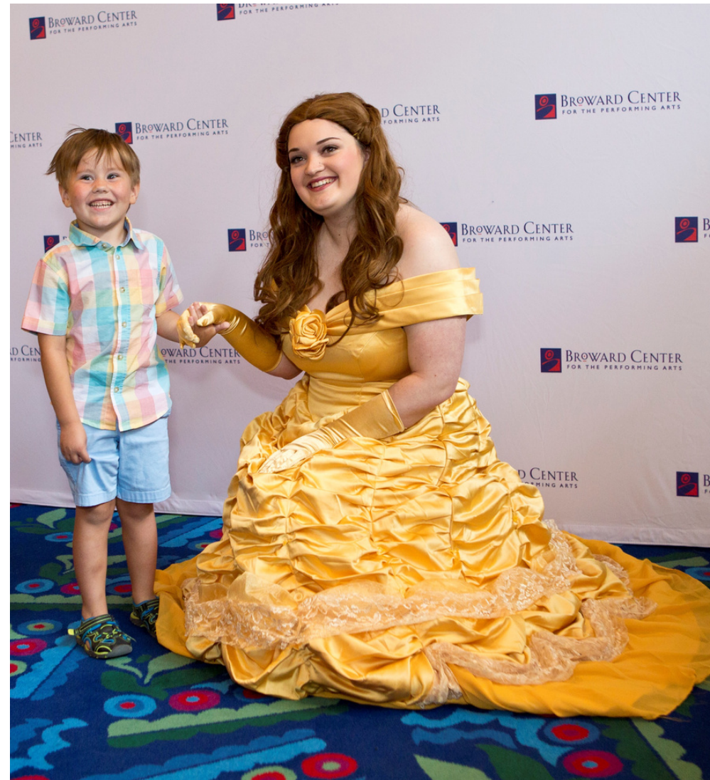
Meet the actors