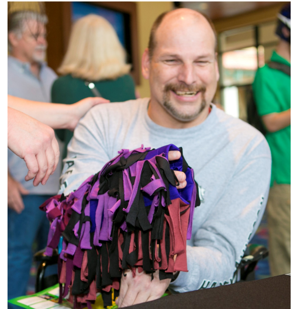
Touch costumes from the show