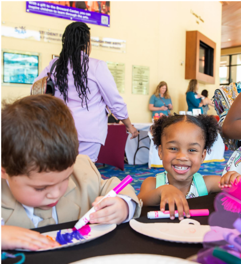
Arts and crafts

In the lobby, I may get to do arts and crafts, meet the actors, or touch the actor's costumes from the performance. I will wait patiently until it is my turn for the activity.