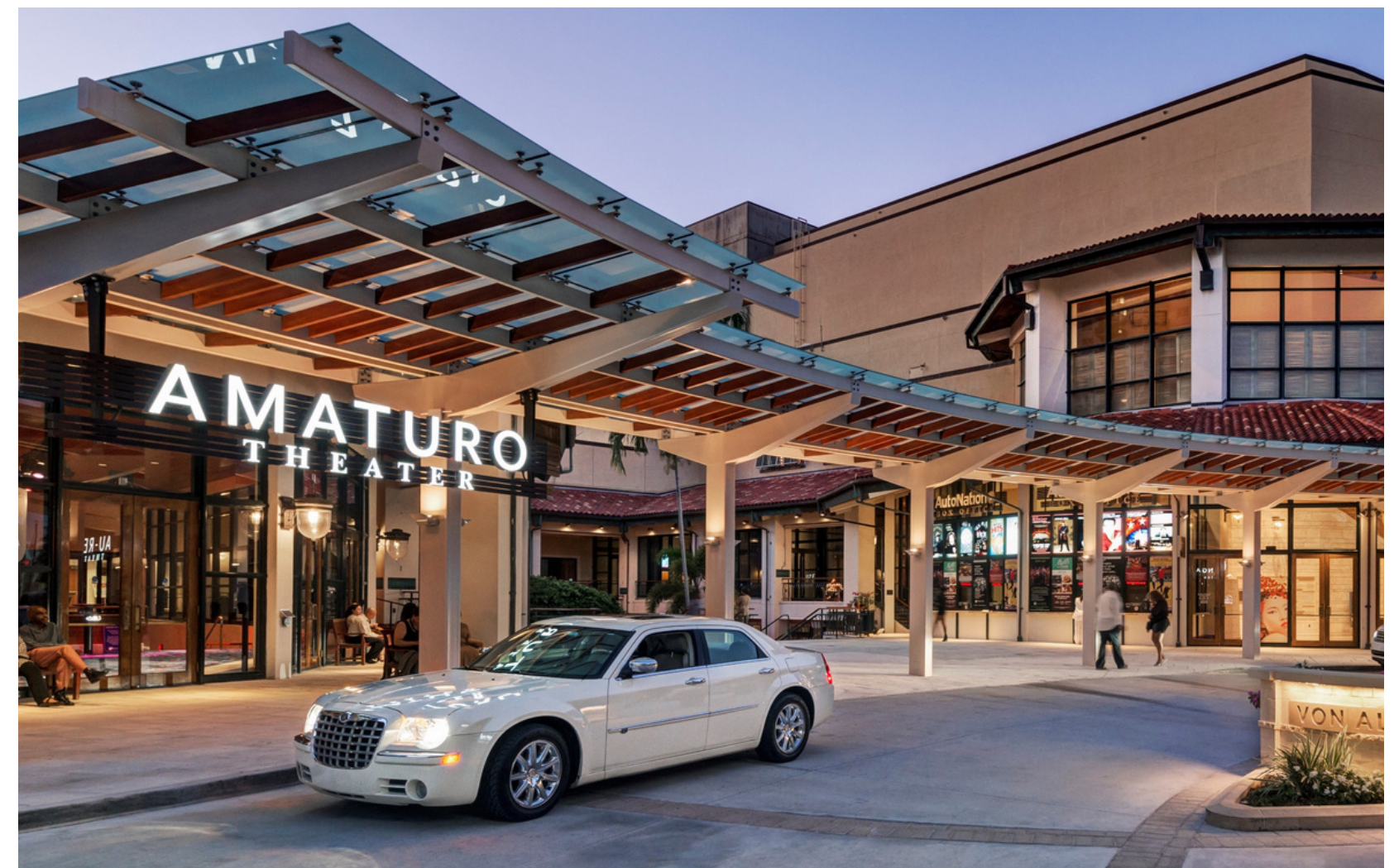
Top of the hill: Amaturro Theater