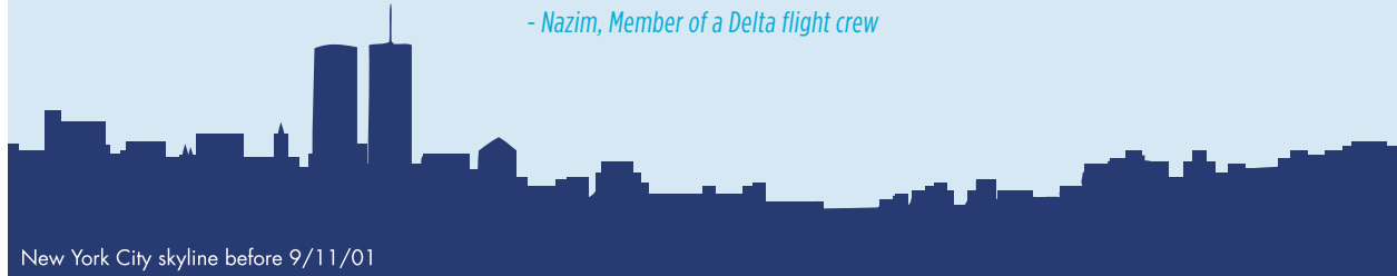
New York City skyline before 9/11/01