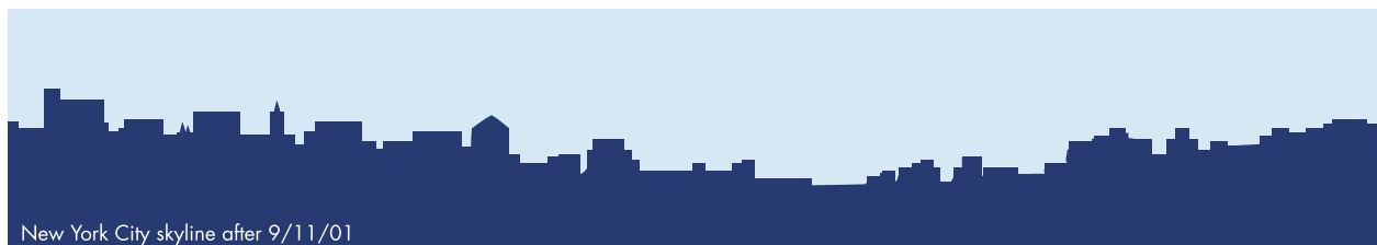
New York City skyline after 9/11/01

President Bush declares that America, along with its friends and allies would “stand together.” to win the war against terrorism.