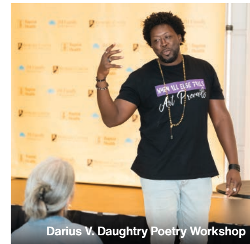
Darius V. Daughtry Poetry Workshop