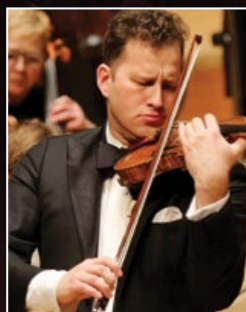
Nikolaj Znaider Violin