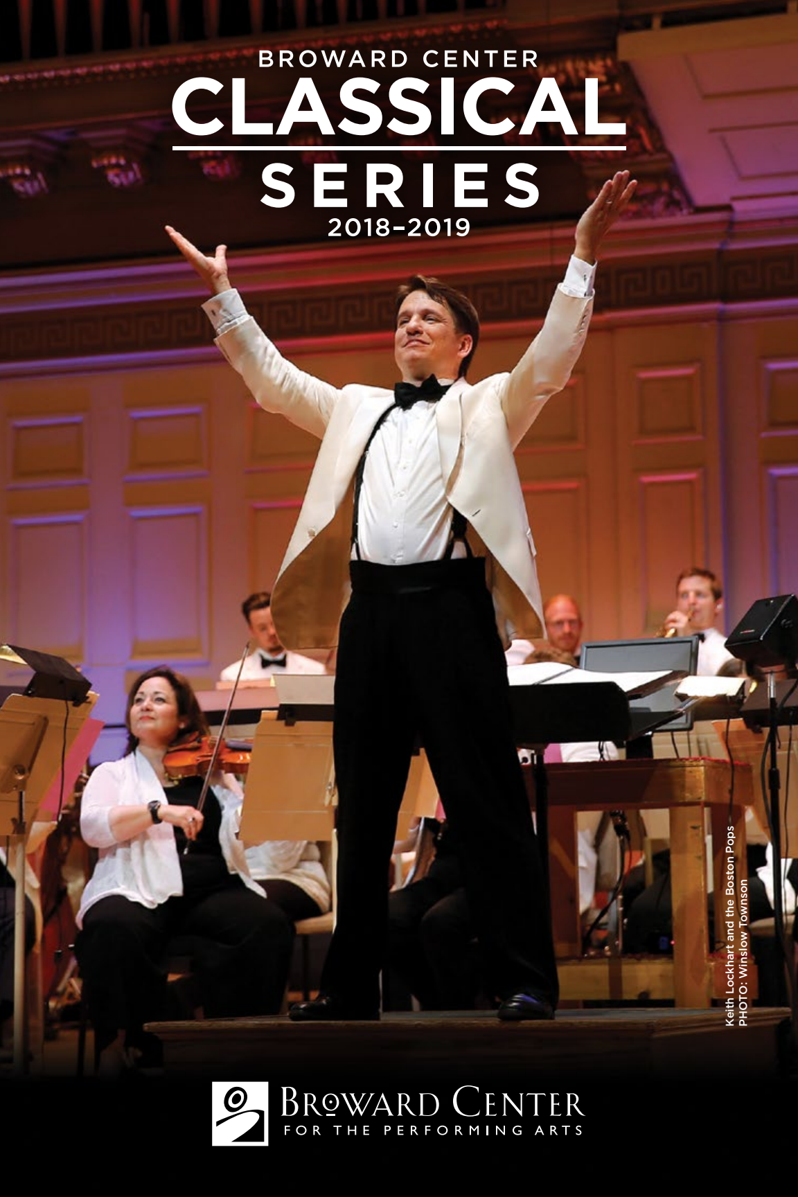
Keith Lockhart and the Boston Pops