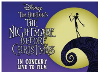
Disney in Concert: Tim Burton's The Nightmare Before Christmas December 13

NONPROFIT ORG U.S. POSTAGE PAID Ft. Lauderdale, FL Permit No. 2924