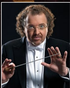
Stéphane Denève Conductor