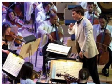
Boston Pops on Tour with Keith Lockhart February 10