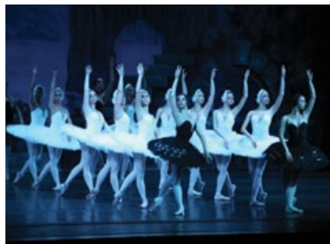
Russian National Ballet Theatre Swan Lake February 24

NONPROFIT ORG U.S. POSTAGE PAID Ft. Lauderdale, FL Permit No. 2924