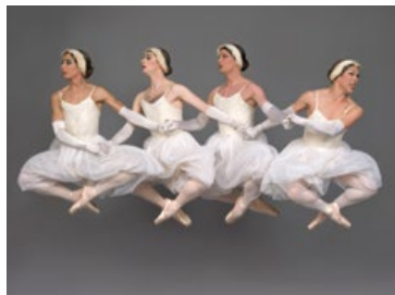
Les Ballets Trockadero de Monte Carlo April 7