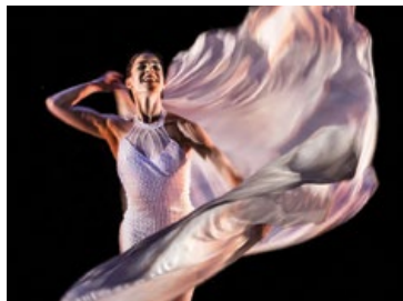
Viva Momix February 27 & 28