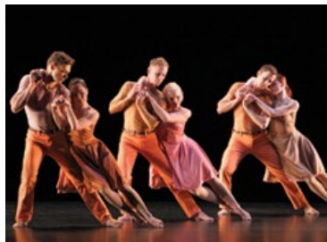
Paul Taylor Dance Company Esplanade & Other Works March 19 & 20